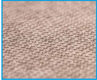
Wooden floors 18/21/24/27 mm