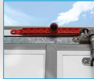
Third brake light with integrated reversing camera