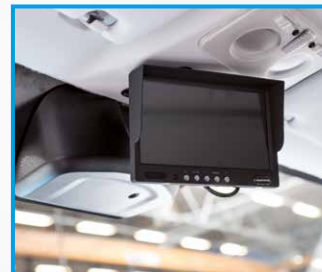
Monitor for the reversing camera in the cab