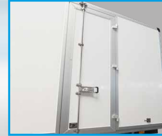
Side doors DRY