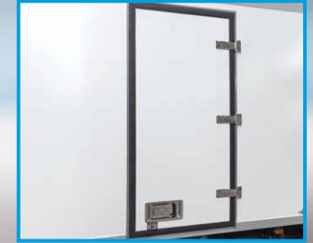
Side doors COOL/FREEZE