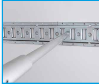
Integrated or patch lashing strips with locking bar(s)