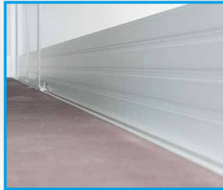
Scuff Plate 150/300 mm