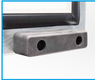
Rubber buffers (optional)